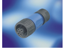
View represents all available contact positions.