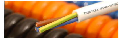
Photographs are for illustrative purposes only

Cable type : H05BQ-F 2x0,75 mm 2 TB28 FLEX Stranding : 42x0,15 mm tinned copper wires Conductor insulation : EPR/EPDM Conductor colours : blue and brown Overall sheath : PUR Colour : black (semi-glossy) Temperature range : -25 °C to +70 °C