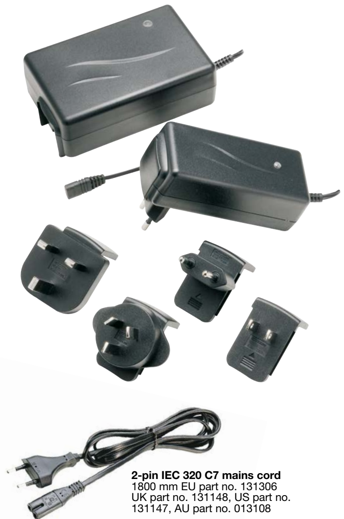
2-pin IEC 320 C7 mains cord 1800 mm EU part no. 131306 UK part no. 131148, US part no. 131147, AU part no. 013108